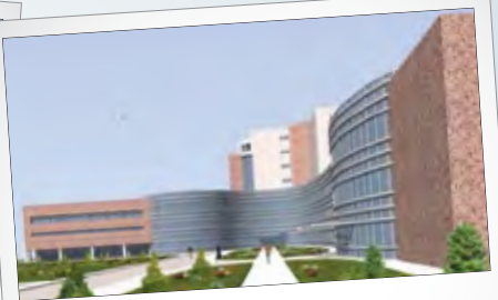
Manisa Soma State Hospital