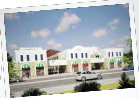
Sapanca Shopping Center