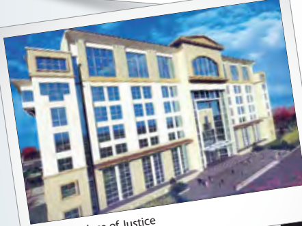
Trabzon Palace of Justice