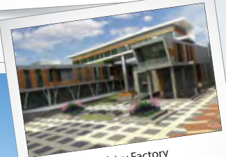
Gülçiçek Chemistry Factory