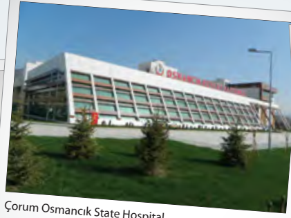
Çorum Osmaniye State Hospital