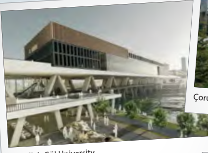
Abdullah Gül University