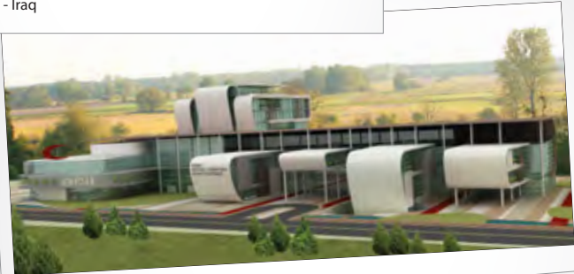
Bursa Mustafa Kemal Paşa Hospital