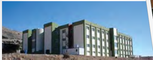
Koya University - Iraq