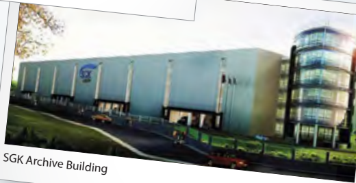
SGK Archive Building