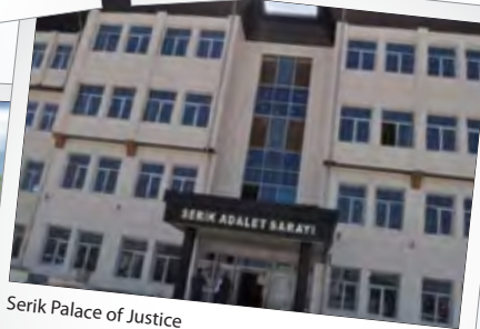
Serik Palace of Justice