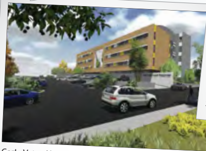
Çorlu Vatan Hospital